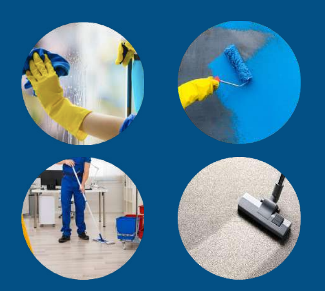
Full Service, 24 hours a day, 7 Days-A-Week